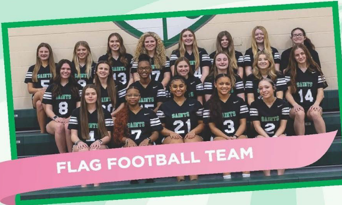
FLAG FOOTBALL TEAM